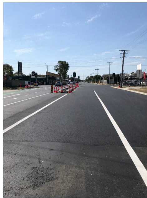
Reconstruction of Campbell Street (between Albert Street and Cambridge Street)