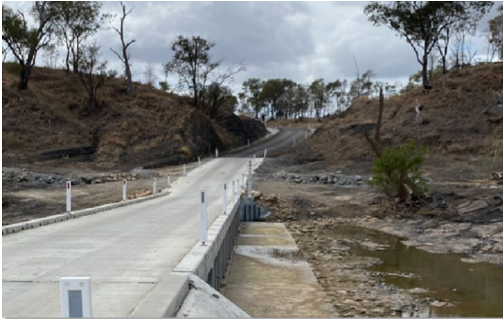
Hanrahan Crossing –After Construction