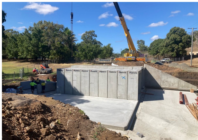
Installing Culverts and Pre-Cast Wingwalls