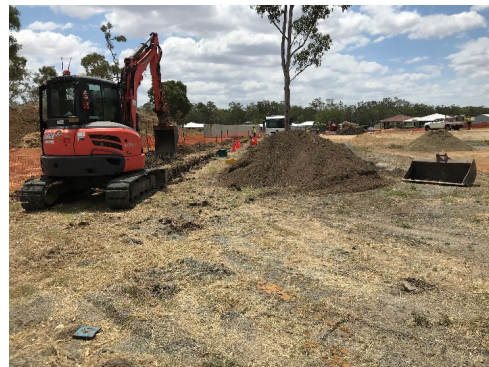
Construction of Stringybark Avenue