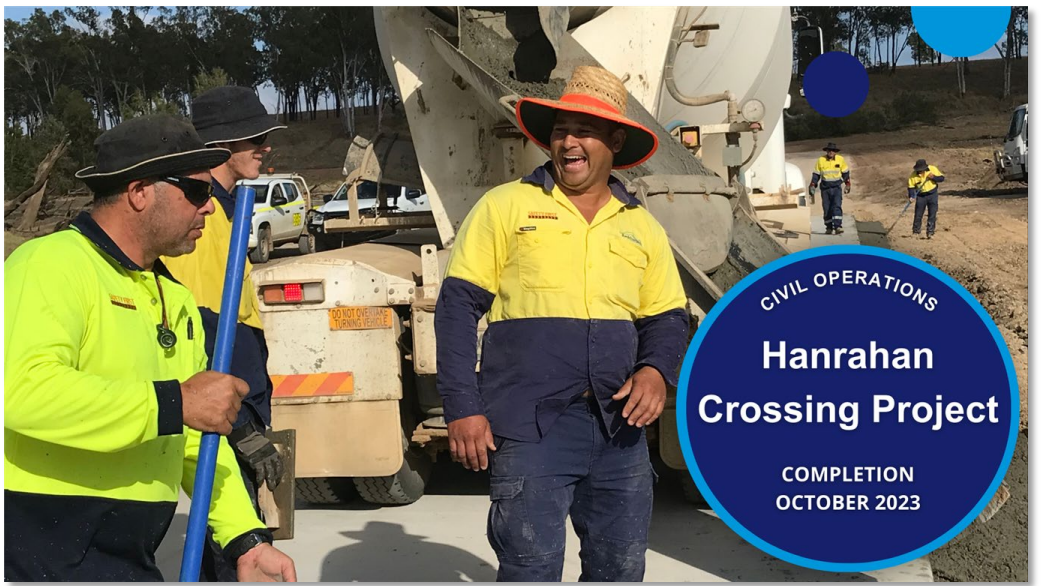
Hanrahan Crossing – During Construction

Comments The crossing upgrade was undertaken by Civil Operations' Rural Crews and improvements included raising the crossing to 1.2 metres above riverbed level, the realignment of the abutment on the southern bank and sealing of both approaches leading up to the crossing. The project was successfully completed in early October 2023. Installation of concrete spoon drains for scour protection has been approved as a minor variation and work will be completed in early November.