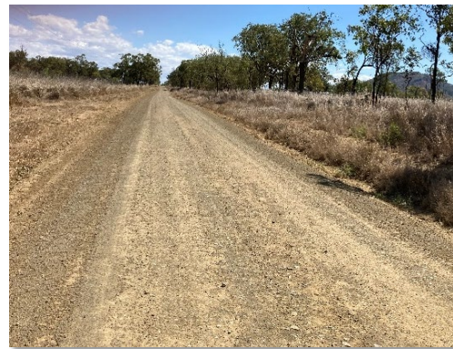
Photos of Hume Road, Callan Avenue and new Garbage Truck Turn Around