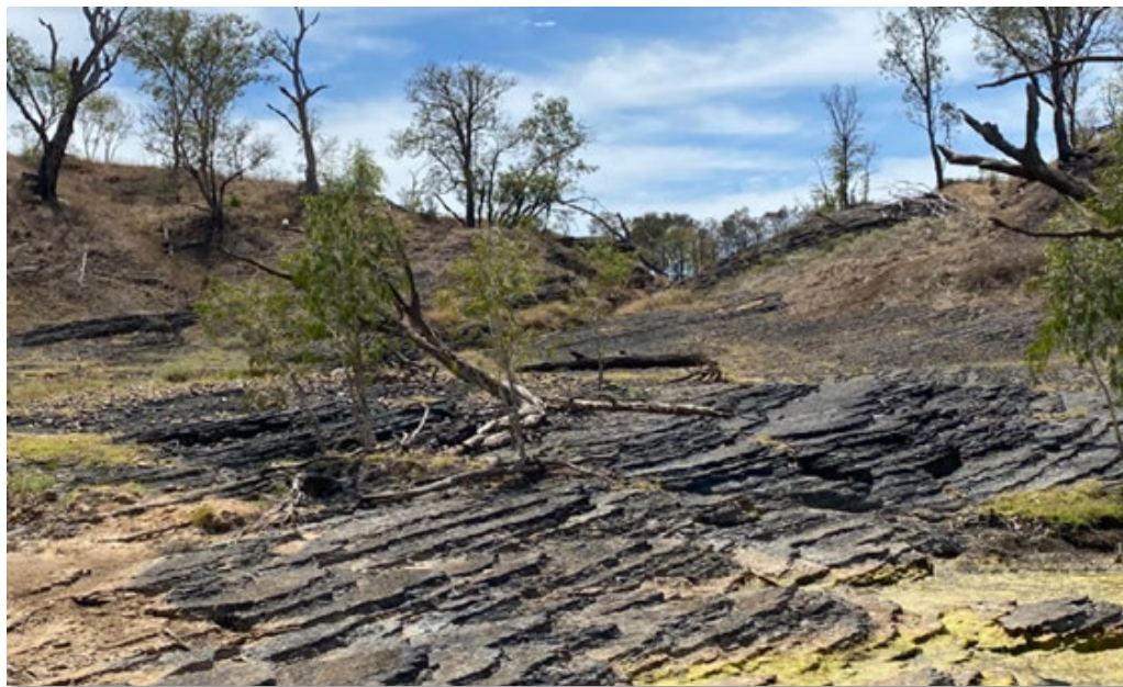
Hanrahan Crossing – Before Construction