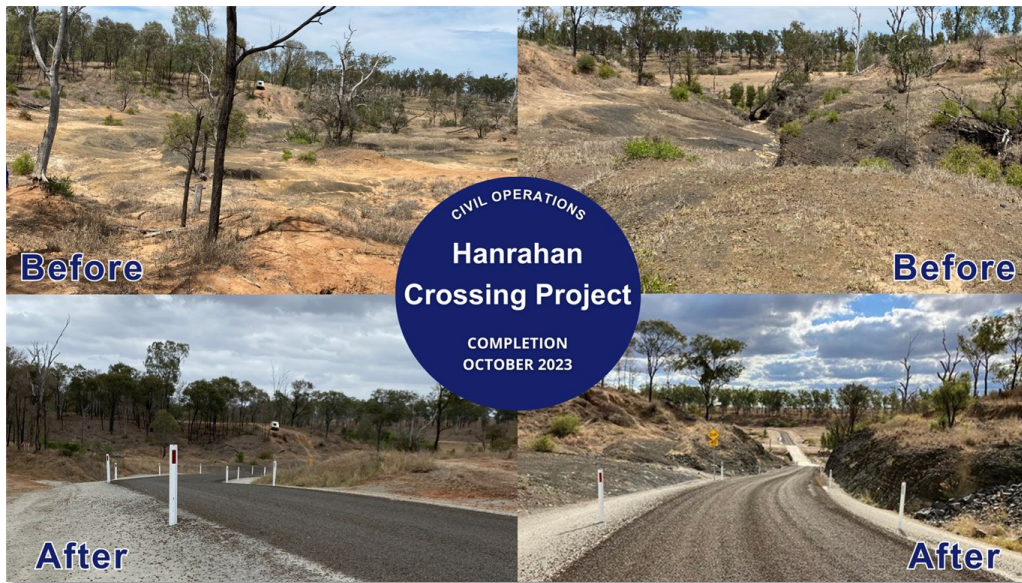
Hanrahan Crossing – Before and After Construction