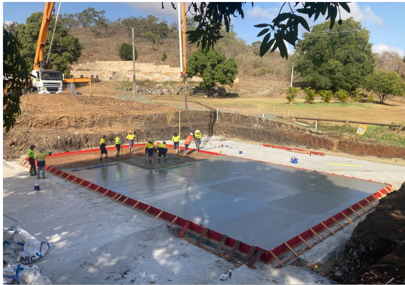
Pouring Base Slab