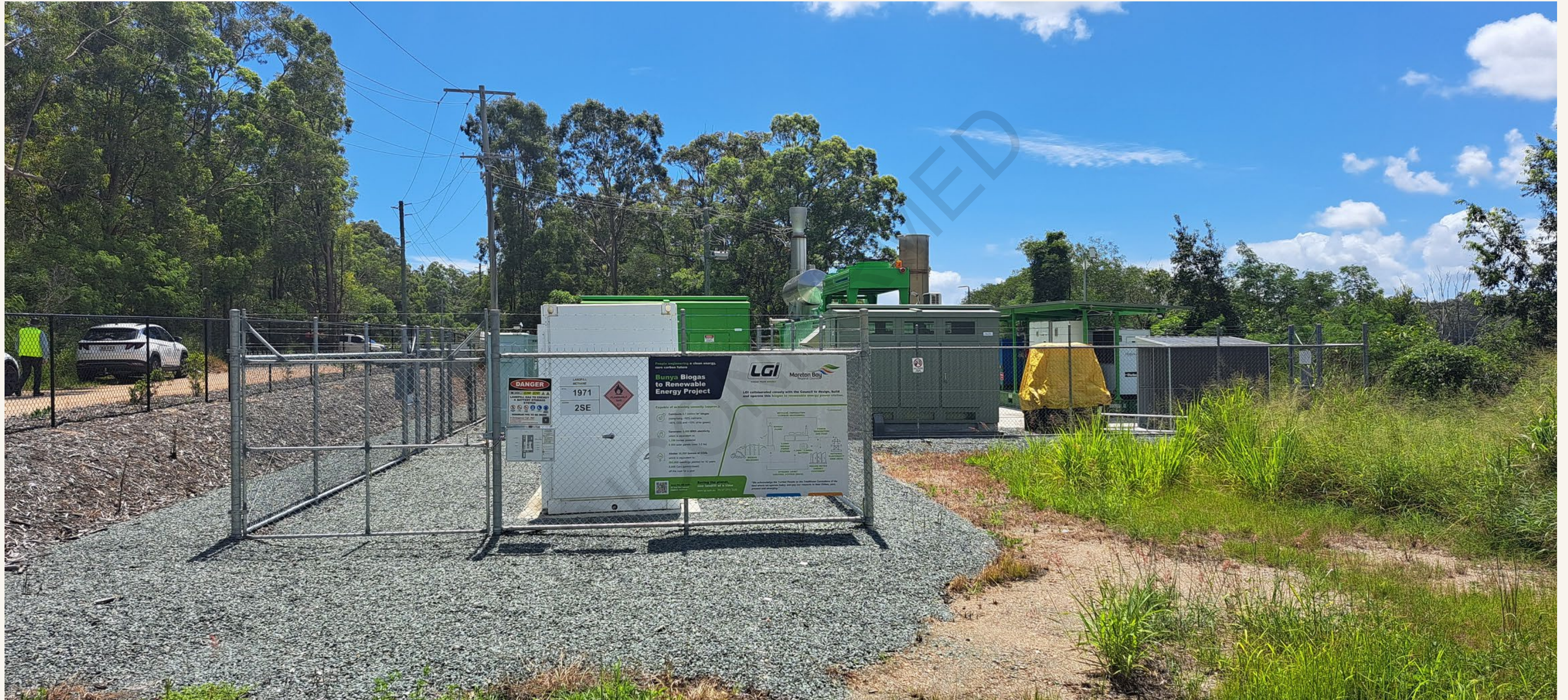
LGI Bunya renewable power station