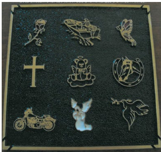
Figure 5 Gold Emblem Samples (can be painted)