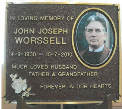
Figure 5 Gold Emblem Samples (can be painted)