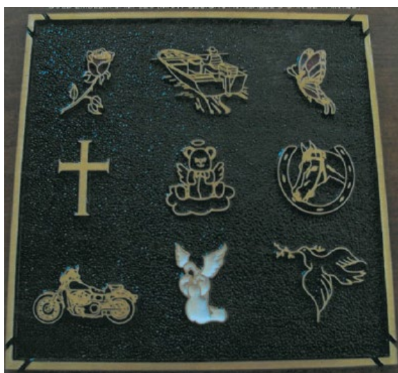
Figure 5 Gold Emblem Samples (can be painted)