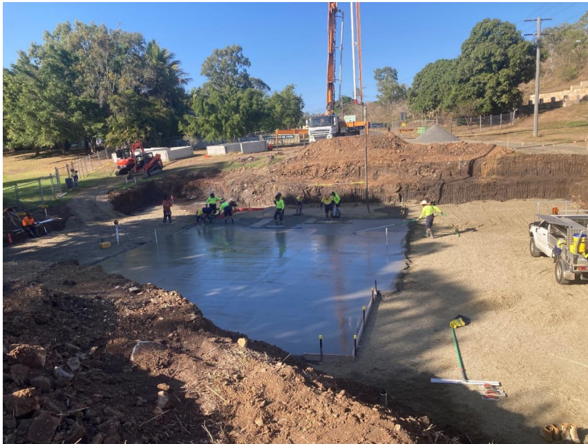
Pouring of blinding slab