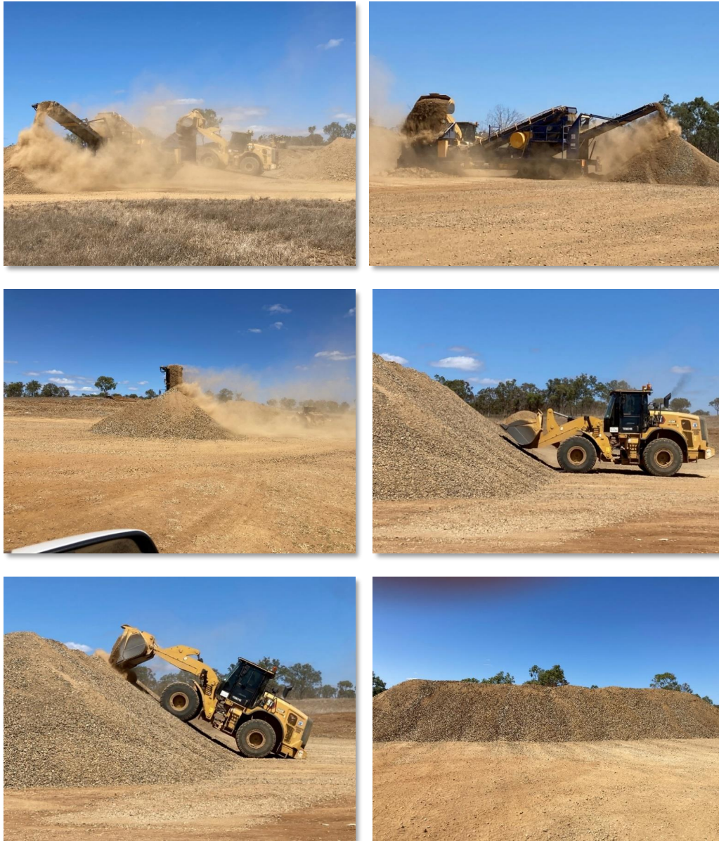
Photos of Rookwood No. 2 Pit - Gravel crushing in production for planned re-sheeting on unsealed roads