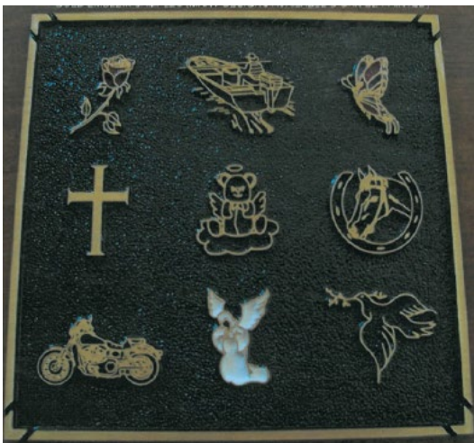
Figure 3 Gold Emblem Samples (can be painted)