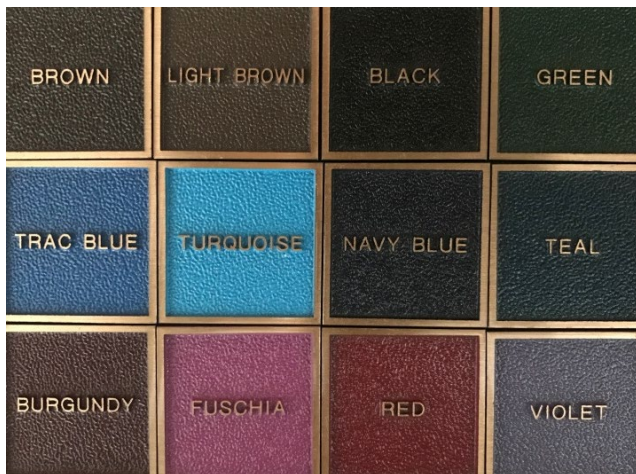
Figure 2 Plaque Background Colours