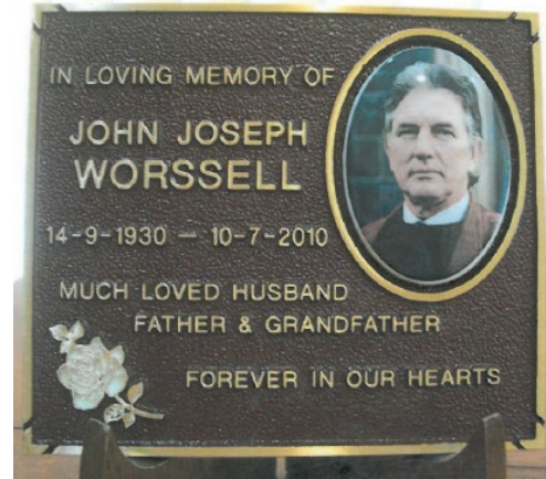
Figure 4 Standard Small Plaque, Standard Border, Burgundy Background, Ceramic Photo, Rose Emblem Painted White