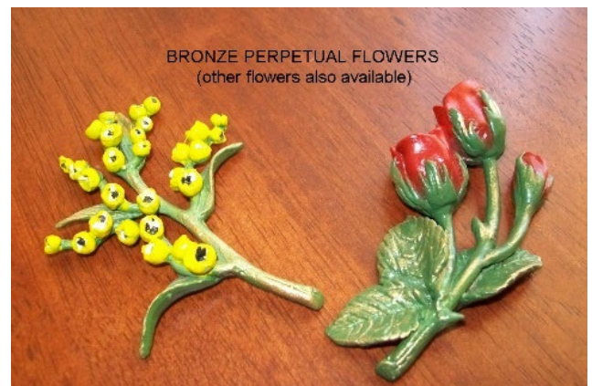
Figure 6 Bronze Perpetual Flower Samples